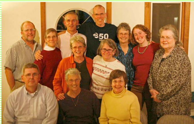
Bill McKibben, 350.org founder, met with the UUMFE Board, Staff and Friends in September 2009.